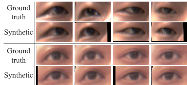
Figure 3. Representative results of eye image synthesis for unseen head poses.

images are obviously satisfactory, therefore we can synthesize training images for gaze estimation efficiently.